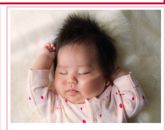
Please contact us for more details

This Study will last for 12 months and will include, 1 Visit to study site, Monthly diary completion (for 6 months) from home and 1 telephone call after 12 months.